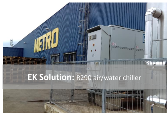
EK Solution: R290 air/water chiller

With over 300 installations of chillers operating with propane, Euroklimat confirms its leadership position as a producer of R290 chillers.