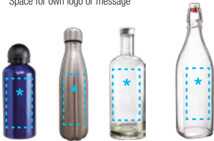
Sport Bottle 60 cl. Inox Bottle 50 cl. Style Bottle 75 cl. Click Bottle 100 cl. - 50 cl. - 25 cl.